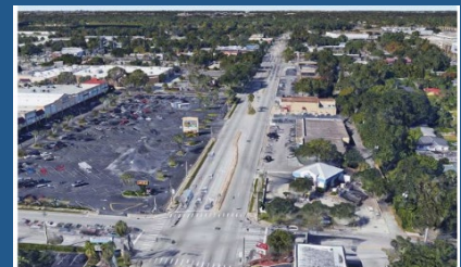
Current Development Practices

Vision 2050 and Orange Code will shape a smarter, more sustainable future for Orange County. Vision 2050 lays out the blueprint for Orange County's growth over the next three decades, while Orange Code establishes the development guidelines needed to bring this vision to life.