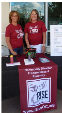
Orange County Library System