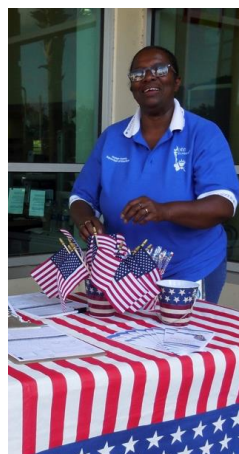
Orange County Supervisor of Elections